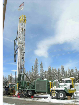
Fig. 4: Drilling equipment.

This product is one of the first MEMS open loop accelerometer able to compete with QAT160 / T185 from Honeywell for applications where high stability under harsh environment and temperature up to 125°C are required.