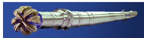
Fig. 2: Rotary steerable drilling system.

Various other drilling techniques are used depending on soil configuration and constitution along with breadth and depth of the holes.