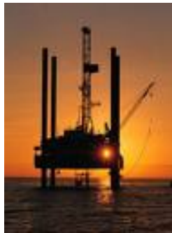
Fig. 1: Offshore platform

Whether for prospecting, surveillance or exploration, there are different techniques to produce either rock chips or core samples.